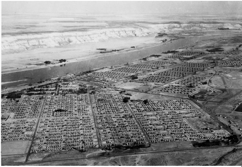
1944 Hanford Construction Camp