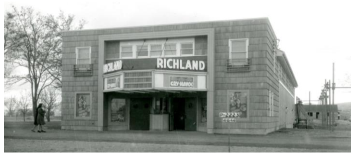
Recognize Richland Players Theatre?